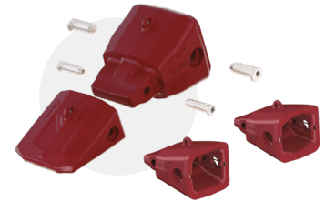
TWINMET Retrofit for first TWINMET experiences

The original 3-part system in size 5 and 7 is made for TERRA cast lips and provides maximum productivity and reliability in highly abrasive terrains with high impacts.