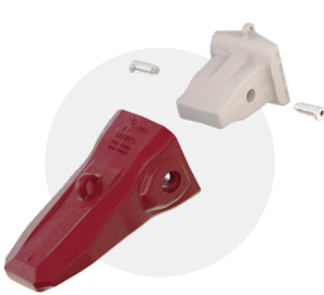
TWINMET 1 for excavators of 250 – 400 t

The 2-part tooth system is especially designed for smaller TERRA cast lips of 116" and 136" that operate in terrains with low to medium level of abrasion and impact.